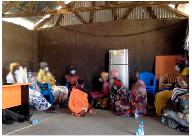
Survivors discuss impact of CRSV during Focus Group Discussions. June 2021.

To meet social, economic and psychosocial needs, survivors in different locations have expressed a desire for a women friendly space - “a centre for socialisation of victims” - where they could meet and share their stories, produce traditional handicrafts (including to generate income), be visited on a weekly basis by a counsellor or psychosocial expert, and raise awareness in the community.