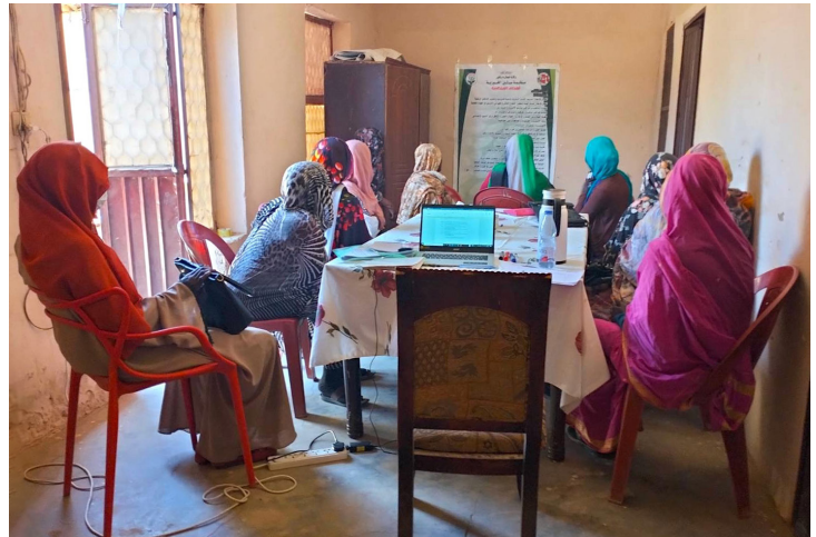
Focus group discussion, North Darfur, April 2022

Survivors of CRSV have different levels of knowledge about their rights as well as the right to reparation. Some were unaware of the right to reparation. A number said the harm is from God and they await God's decision with regard to the violation against them, many of those interviewed shared this view: "What happened is seen as God's will, and God alone can compensate you". One survivor when asked about reparation identified it with "Taweed" (local term for compensation in traditional justice) or "Jabr Darar" (damage repair). Another survivor, who was raped by a soldier, said she knows nothing about human rights and did not report the ordeal to anyone because she was unaware of how to react to the entire situation. Under Sharia law, the crime of adultery also creates a chilling effect on reporting crimes. Intercourse outside wedlock is a serious crime, meaning that the victim might easily be accused of adultery when reporting rape – for which the punishment of death by stoning continues to be applied.