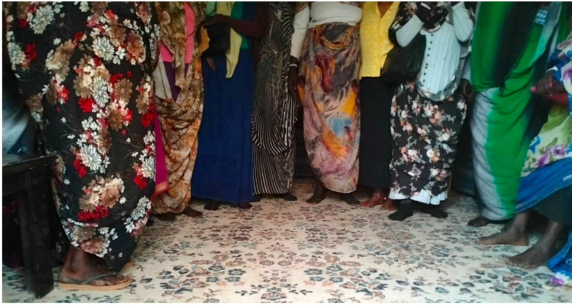
Dancing can be a way to reduce anxiety and stress: trauma awareness training, North Darfur, April 2022 © Rights for Peace.

So far, survivors have not engaged in advocacy initiatives. There are mixed responses about pursuing justice. Some express mistrust in the judicial system, while others fear reprisals "I was threatened by the security. They pointed the guns to my head and asked me why I talked to a human rights organisation."